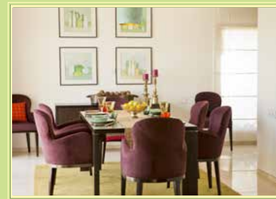
SHOT AT THE MODEL VILLAS

The Pavilion Villas at Brigade Orchards are singular residences, created to respect the environment. They are designed around trees that are a part of the original orchard, and flow smoothly into airy spaces that draw in light. Built over three levels, every Pavilion villa is created with amenities for a pampered lifestyle. Double height ceilings, king-sized bedrooms and a large kitchen are all designed around a courtyard garden that is the focal point of each home.